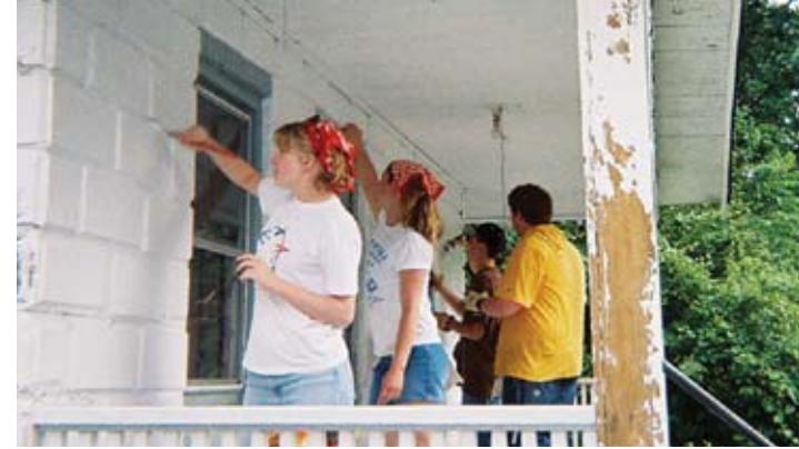
^ Youth at work on a mission trip supported by the Hennepin Foundation.

I want to contribute to the programming of my church through the Hennepin Foundation.